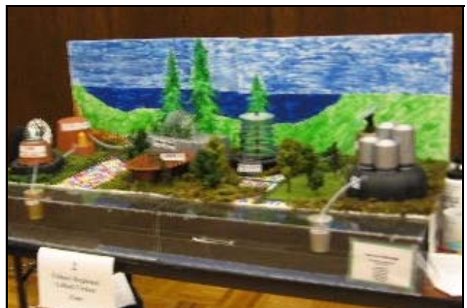
Photographs of two models submitted for the Future City Competition.