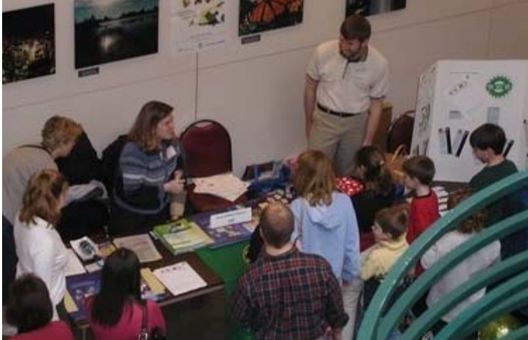
ScavEngineer booth staffed by SWE-CRS members.

This year the Society of Women Engineers was the sponsoring organization for the national event during the last week of February known as E-Week. The Chicago Regional Section took part in many events all around the Chicago area. One event that was held at the end of the week was called Explore Engineering. This was an open house at Illinois Institute of Technology's Rice