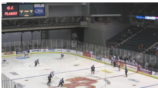
iWireless Center - Home of the QC Flames