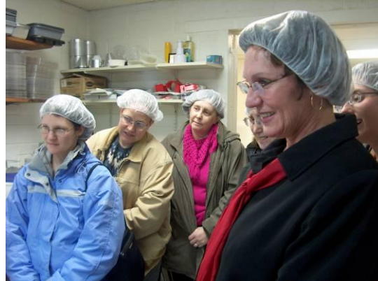
SWE Ladies in attractive hair nets

We had the opportunity to sample chocolates, caramels, taffy, chocolate covered raspberries and chocolate covered strawberries. We also learned how to make chocolate tulip cups for our next evening of entertaining. They hand make all of their chocolates at the Bettendorf store. I know that they gained some new customers from the evening! Thank you to everyone involved in planning such a great night.