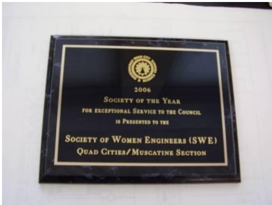
Picture of the Award

The Society of Women Engineers (SWE) – Quad Cities/Muscatine Section was selected as the 2006 Quad City Engineering & Science Council (QCESC) Society of the Year. The award was received during the 45 th Annual Engineers Week Banquet held at the Lodge on February 23 rd . Congratulations ladies!