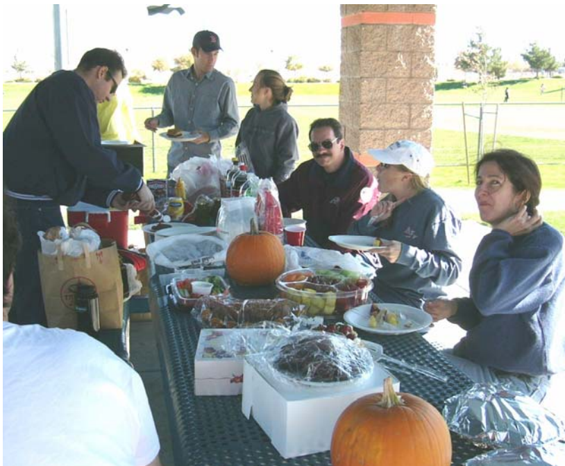
The group feasts at Marie Kerr Park in Palmdale.

On October 23, 2004, the SWE-AV welcomed the arrival of fall with a potluck picnic at Marie Kerr Park in Palmdale. Family and friends joined SWE members for an afternoon of food, fun, and pumpkin carving. Although the park was overflowing with energetic little leaguers and their families, we found a cozy section of the park to enjoy eating and socializing. Everyone had a great time